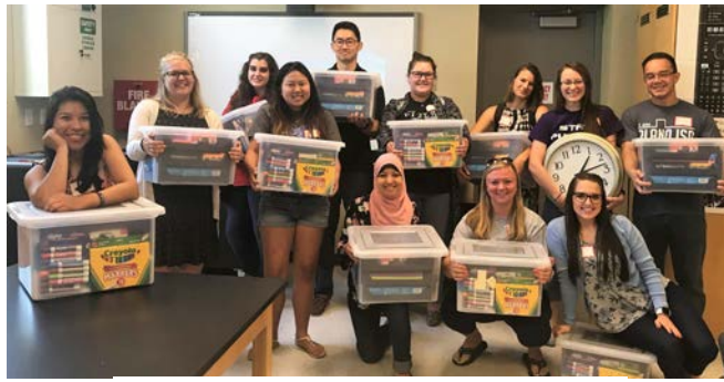
New Teacher Kits!!!!!!