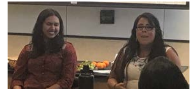
Alumni Supporting New Teachers!